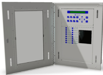
Shown in A901-BOX-SINGLE-F-W

Box and Door Ordered Separately. See Bulletin F-555: 901 Cabinets