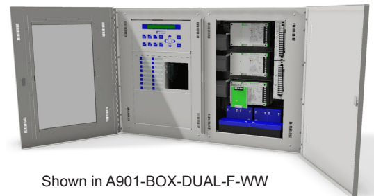
Shown in A901-BOX-DUAL-F-WW