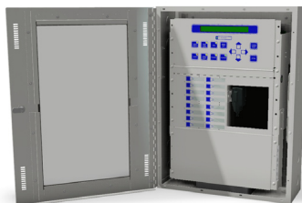
Shown in A901-BOX-SINGLE-S-W